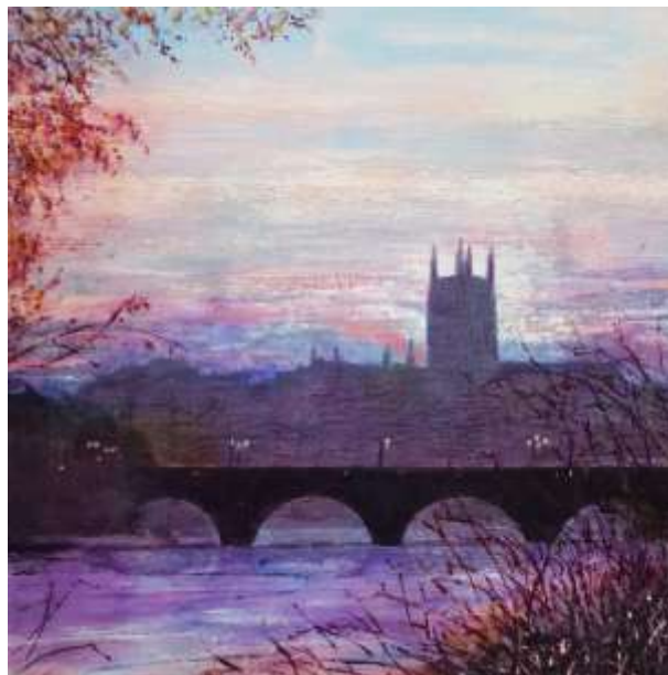
Rising Water Worcester